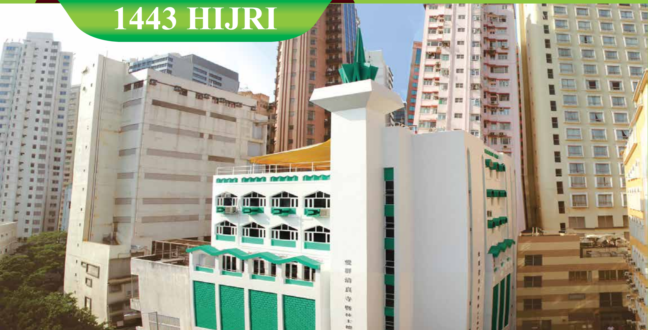
Masjid Ammar, Wan Chai, Hong Kong