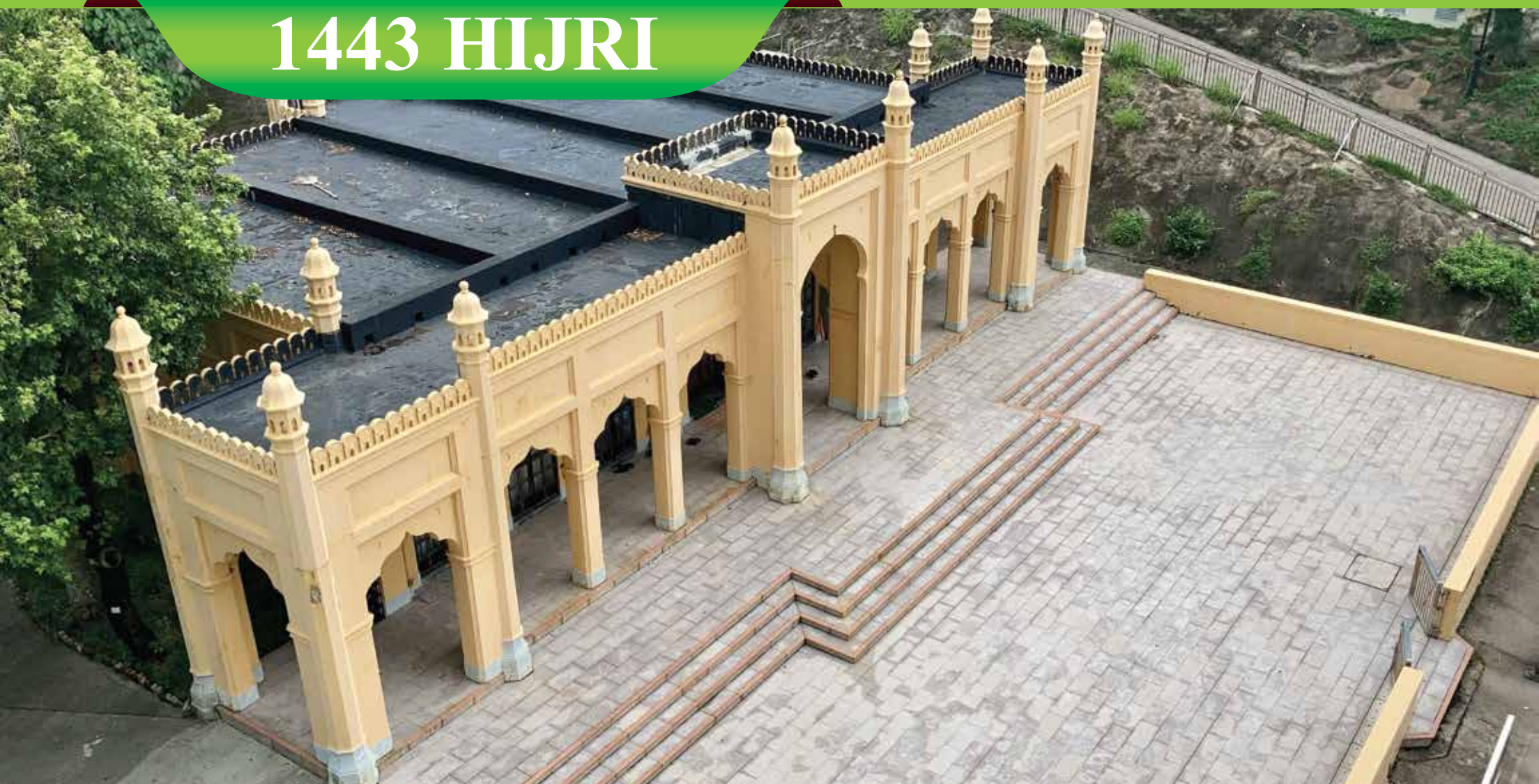
Stanley Masjid, Hong Kong