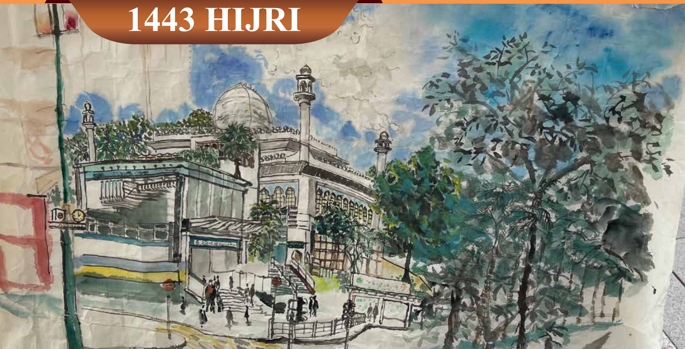
Handmade Sketch of Kowloon Masjid & Islamic Centre, Hong Kong