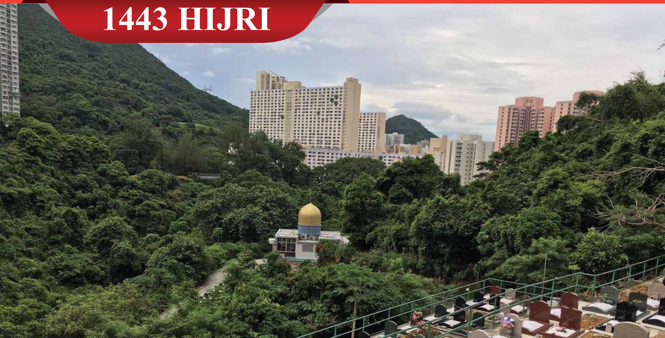
Chai Wan Masjid, Cape Collinson, Hong Kong