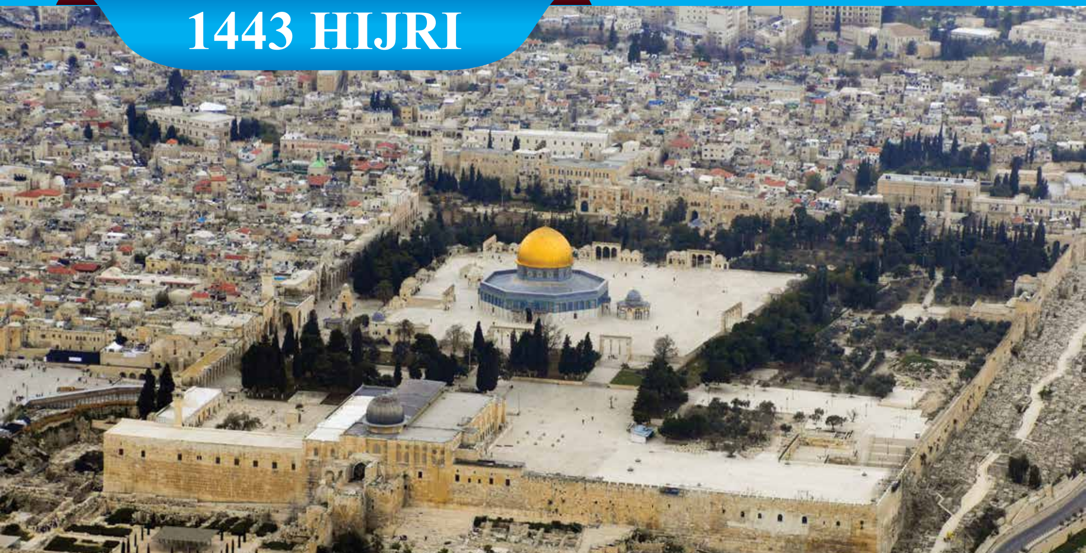
Masjid Al-Aqsa, Jerusalem