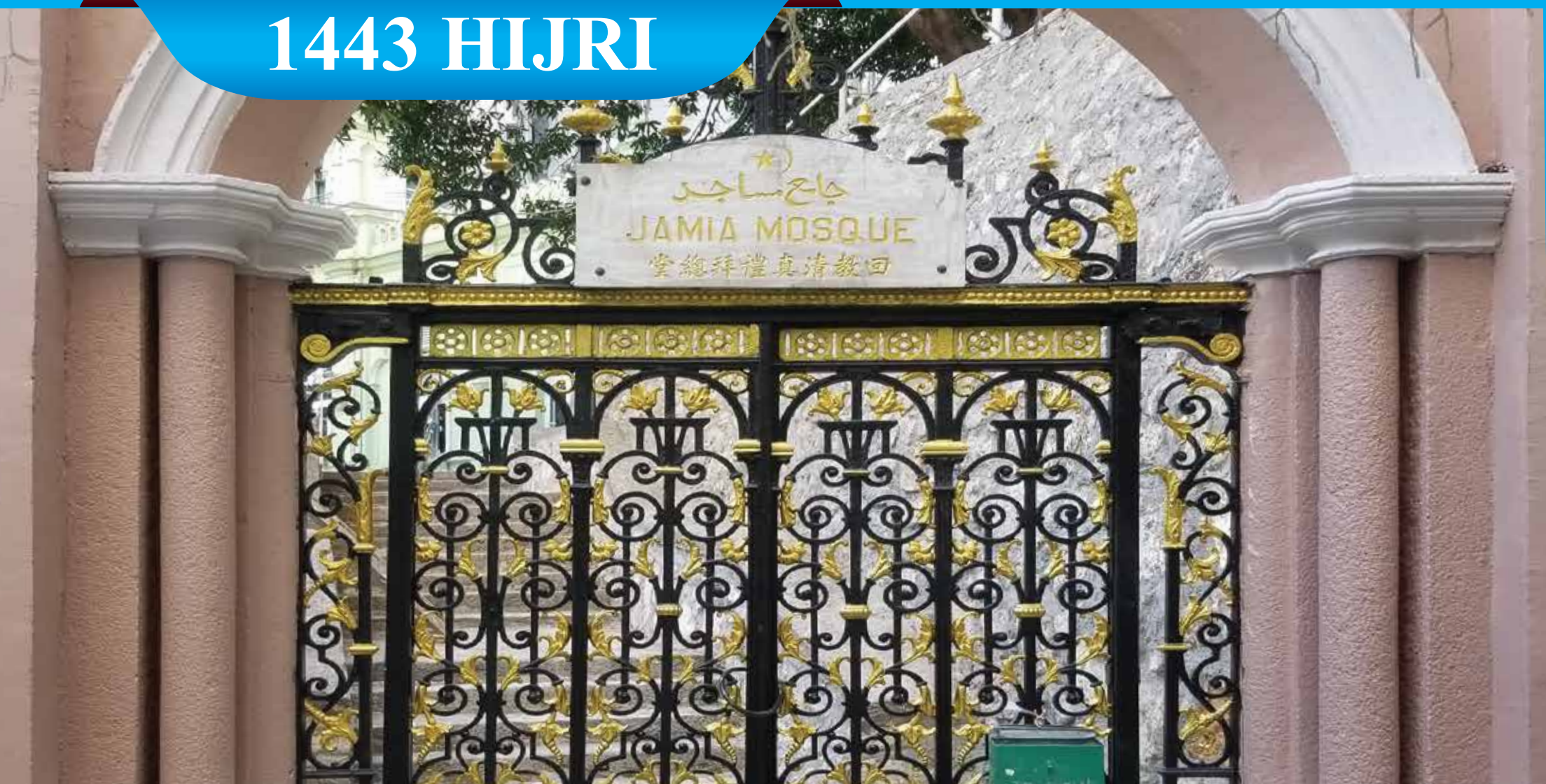
Main Entrance Gate of Jamia Masjid, Central, Hong Kong