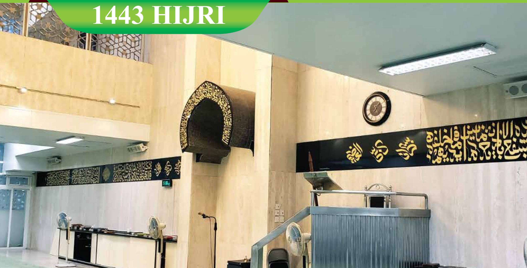
Mehrab Mimbar of Masjid Ammar, Wan Chai, Hong Kong